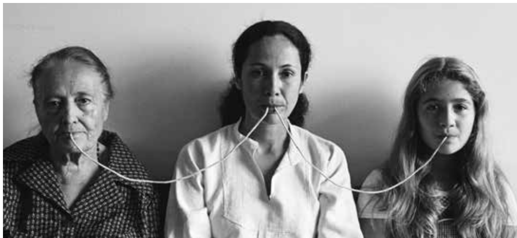
Anna Maria Maiolino Por um Fio, da série Fotopoemação (By a Thread, from the series Photopoemaction) 1976