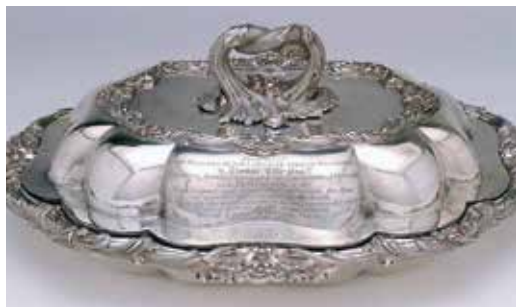
Silver entrée dish (object lent by Charles Stuart Dudley Cole)

🏠 www.museumoflondon.org.uk/docklands 🐦 MuseumofLondon 🚶 West India Quay, Canary Wharf 🚶 D3, D7, D8, 277, D6, 15, 115, 135