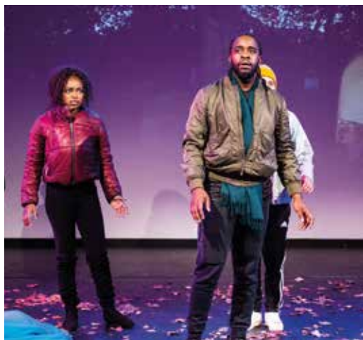
Purple Moon Drama