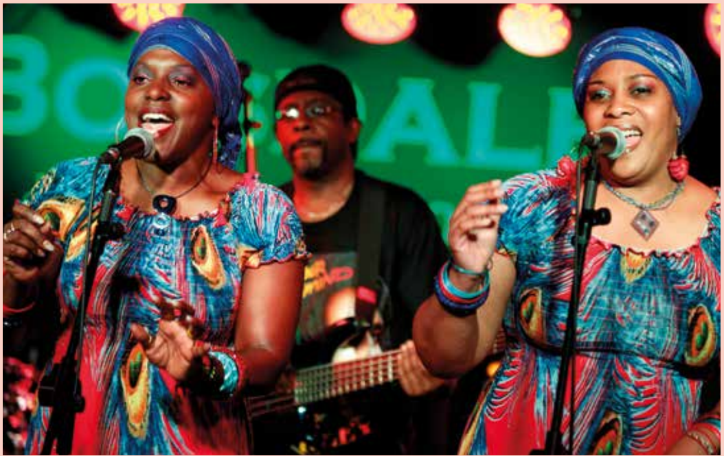
Legend: The Music of Bob Marley and the Wailers, page 7